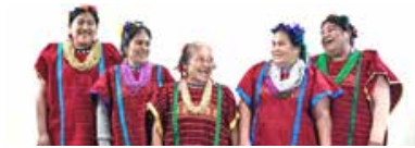
TRIQUI DANCERS