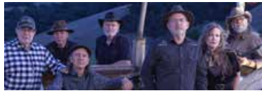
RAYBURN BROTHERS BAND | RB **NEW TO FNM**

Site 20: Conference Ctr., Steinbeck Ballroom 6:30-7:00 | 7:15-7:45 | 8:00-8:30