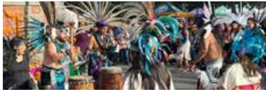
WHITE HAWK INDIAN COUNCIL FOR CHILDREN | DA **NEW TO FNM**

Indigenous Triqui women from Greenfield will perform a traditional dance to Oaxacan music, wearing the symbolic, hand-made Triqui huipil. The huipil represents rebirth, with symbols like the sun (collar), rainbow (back ribbons), caterpillar's path (red strips), and the figures depict the butterfly's flight. The Triquis, originally from southern Mexico, migrated to California to work as agricultural laborers.